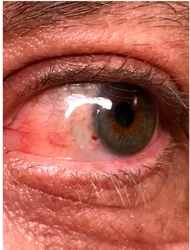
Figure 2 Example of a patient at post-operative day 30 results.

post-operative week 1, once the corneal epithelium was completely healed. In addition, topical loteprednol drops (Lotemax, Bausch and Lomb, Rochester, NY) were used 4 times daily for the first 2 weeks followed by a weekly taper thereafter. Patients remained on the loteprednol once a day until the conjunctival graft was quiet. Patients were seen for a post-operative visit at 1 day (Figure 1) and then within a week after surgery (when the bandage lens was removed) and then at 1 month (Figure 2). Eyes were examined again at least 6 months post-operatively for signs of recurrence or complications and then annually for several years when patients kept their follow-up. All results were recorded.