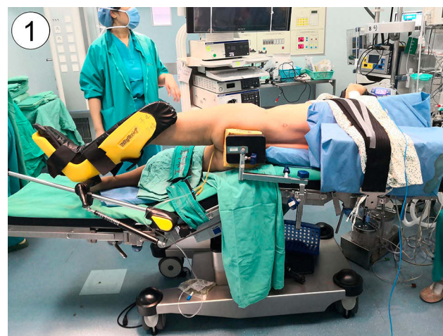
Figure 1 Patient position. The patient was placed in standard 90° full flank position and secured to the table, then the table was rotated to maximize exposure of the kidney.

After general anesthesia, patients were placed in standard 90° full flank position and secured to the table, then the table was rotated to maximize exposure of the kidney (Figure 1). The layout of the trocar is shown in Figure 2. A 2-cm incision was made at the center between the 12th rib and the erector spinae muscle (port B), the retroperitoneal space was entered by blunt finger dissection. After a retroperitoneal working space had been created using a balloon dissector, a 10-mm trocar was inserted at the middle axillary line 3 cm cephalad to the iliac crest (port A), and another 5-mm trocar was placed at the tip of the 11th rib (port C). After the pneumoperitoneum was created, laparoscopic camera and instruments were placed into port A, B and C, respectively. By dissecting along the psoas muscle, the posterior surface of the kidney was reflected medially. Then renal pedicle was identified with dissection of the renal artery and vein (Figure 3). After the renal vessels were isolated and clipped successively by Hem-o-lok clips, kidney was mobilized outside the perirenal fascia. The adrenal gland was spared in all cases unless involvement was suspected. The ureter was then mobilized caudally toward the level of iliac vessels. A surgical drain