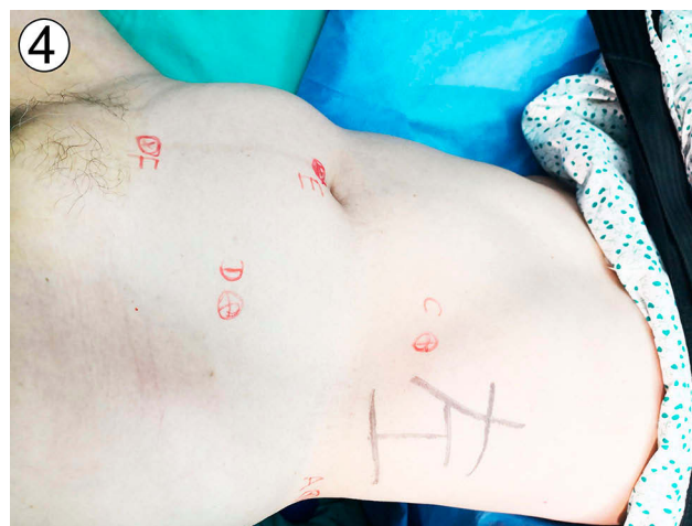
Figure 4 Trocar placement in transperitoneal operation. A 10-mm trocar at the lower level of the umbilicus (port E), a 5-mm trocar at the midpoint of the line between the umbilicus and the anterior superior iliac spine (port D), and the last 12-mm trocar was placed 2 cm cranial to the pubic symphysis in the middle line (port F).