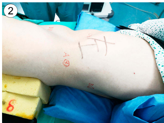
Figure 2 Trocar placement in retroperitoneal operation. A 2-cm incision was made at the center between the 12th rib and the erector spinae muscle (port B), a 10-mm trocar was inserted at the middle axillary line 3 cm cephalad to the iliac crest (port A), and another 5-mm trocar was placed at the tip of the 11th rib (port C).