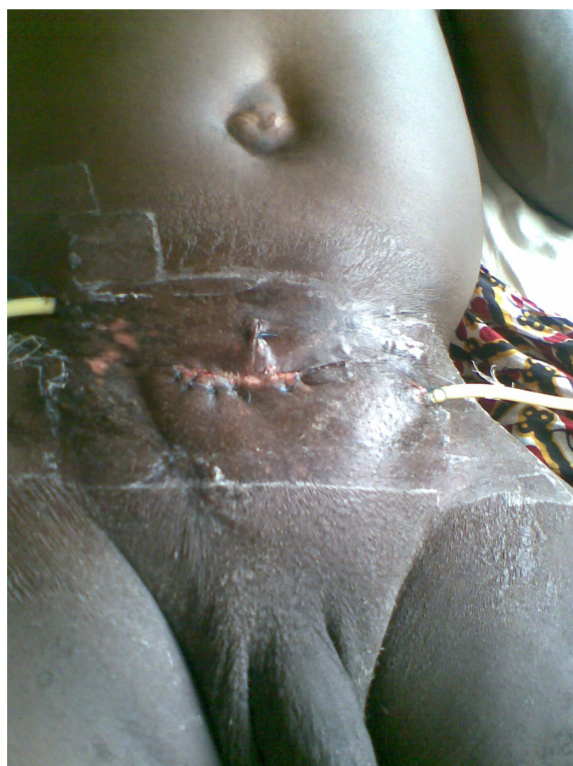
Figure 2 Postoperative closure of post open prostatectomy bladder exteriorization.

The bladder was mobilized, reconstructed and closed in two layers with absorbable 2/0 chromic catgut. A layered anterior abdominal wall closure was undertaken. The retro-pubic space was drained with a fenestrated Foley's catheter size 18 Fr, and the bladder drained through a separate stab wound. A urethral catheter was inserted. The patient had a cystogram performed 3 weeks post surgery that revealed no bladder leakage (Figure 3). He was discharged and has remained continent in the postoperative period.