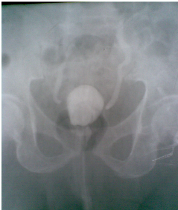
Figure 3 Postoperative bladder exteriorization cystogram.

meatal and submeatal stenosis (2.5%) and bladder neck contracture (0.35%). 7,8