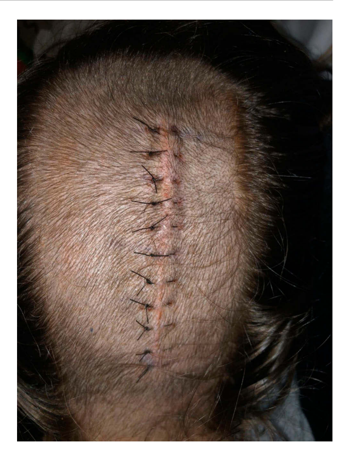
Figure 2 Pineal cyst resection - craniotomy incision.

An 18-year-old obese female with a body mass index of 33.4 and a history of irritable bowel syndrome (IBS) and severe gastroparesis presented to APMS during readmission for inability to tolerate oral intake following supracerebellar transtentorial resection of 10 cm pineal cyst. Patient's incision is shown in Figure 2. She had been discharged home on postoperative day (POD) two and readmitted for severe headache, nausea, vomiting, and constipation on POD three. The headache was primarily localized to the frontal region with associated photophobia. Neurologic exam was nonfocal, and imaging of the head revealed expected postoperative changes. She was started on acetazolamide 500 mg BID, dexamethasone 10 mg intravenously followed by 4 mg