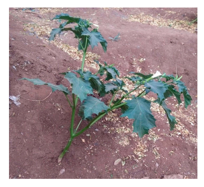
Figure | Picture of Datura stramonium.

Various studies showed that Datura stramonium endowed antiepileptic, anti-obesity, anti-microbial, anti-