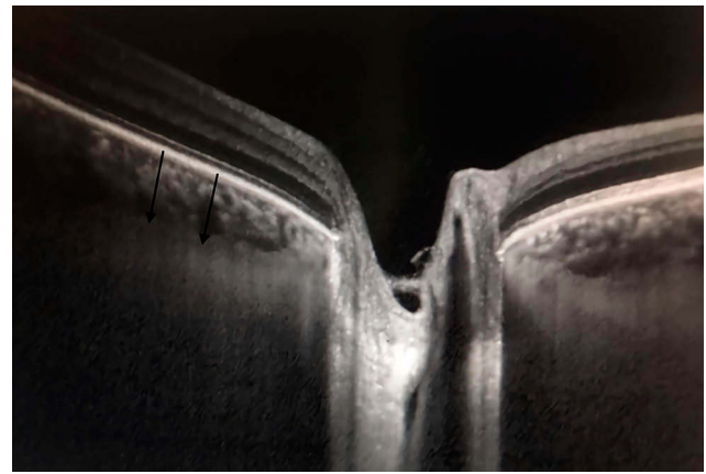
Figure 1 Manual measurement of PPCT in EDI-OCT image.

Data obtained by measuring subfoveal and peripapillary choroidal thickness measurements, systolic, diastolic