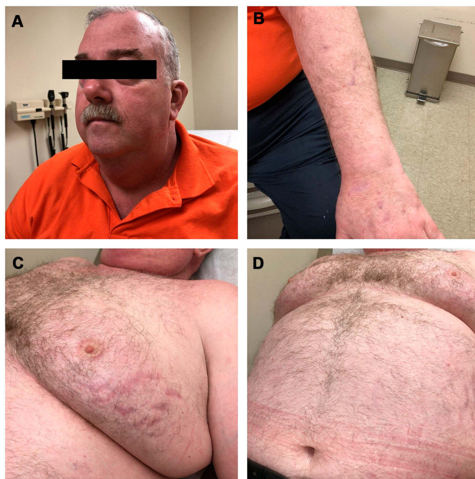
Figure 2 Follow-up images were collected at the patients most recent outpatient appointment, 7 months after the first intra-articular injection, showing resolution of symptoms. Of note resolution of (A) Cushingoid facies, (B) extremity bruising, wide violaceous striae of the (C) chest and (D) abdomen.

It is often thought that inhaled, intranasal and intra-articular steroids do not have the same side effects as systemic steroids, but lately it has been shown that in certain populations, this is not the case. 7 Patients who are on medications that inhibit CYP450 metabolism in the liver – such as RTV and cobicistat – are at higher risk to develop ICS. In such patients it has been documented that they have developed ICS associated with a single dose of non-systemic steroids. 8 Many of these patients develop ICS that is accompanied by HPA axis suppression, as seen in our patient. 8 Other agents