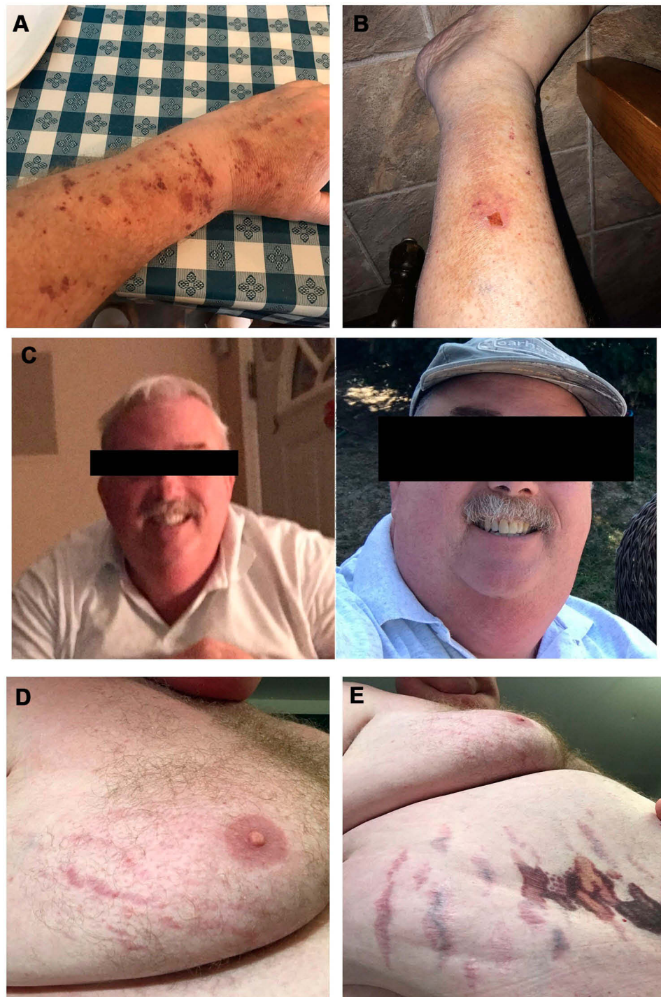
Figure 1 (A) Bruises on the left upper extremity, which developed after the second intra-articular injection. (B) Bruise on the left lower extremity which developed into a non-healing ulcer. (C) Cushingoid facies and facial plethora. The picture on the left was taken a week prior to the first intra-articular injection, and the second picture was taken nearly 2 months after the second injection. (D and E) Wide, violaceous striae on the chest (D) and abdomen (E).

next 2 months he experienced significant weight gain, cushingoid facies and facial plethora (Figure 1C). Five months later he developed sudden-onset shortness of breath and was found to have a PE via Computed Tomography Angiography (CTA) of the chest and a deep vein thrombosis (DVT) via