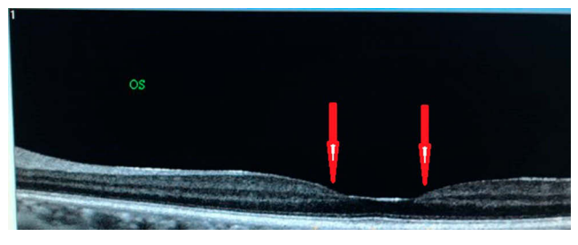
Figure 5 Peri foveal thinning (red arrows) in four eyes of patients in patients group.

Altinkaynak et al<sup>22</sup> measured CT at three loci (subfoveal, 1500 microns nasal, and temporal peri-foveal) using EDI in 58 patients with inactive SLE and compared them with 58 normal controls. The mean (± SD) subfoveal, nasal, and temporal CT values for the study group were 231.2 \pm 57.6 \, \mu m , 190.6 \pm 30.6 \, \mu m , and 222.7 \pm 37.5 \, \mu m , respectively, and for the control group 297.5 \pm 45.1 \mu m, 248.3 \pm 39.7 \mu m , and 286.5 \pm 49.7 \mu m , respectively. There was a statistically significant decrease in all measurements compared with normal controls (p<0.001, for all). Although our patients showed significantly thinner CT in comparison to the control group, they showed an overall thicker Choroid if compared to Altinkaynak et al study. It is of note that our SLE patients were characterized by a higher disease activity (median SLEDAI was 6) which could explain this disparity; furthermore, there was a difference in the measuring points implemented in our