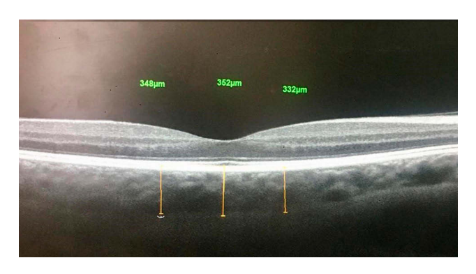
Figure I The choroidal thickness was measured at subfovea, and 750 \mu m temporal and 750 \mu m nasal to the fovea.

Data were coded and entered using the statistical package SPSS (Statistical Package for the Social Sciences)