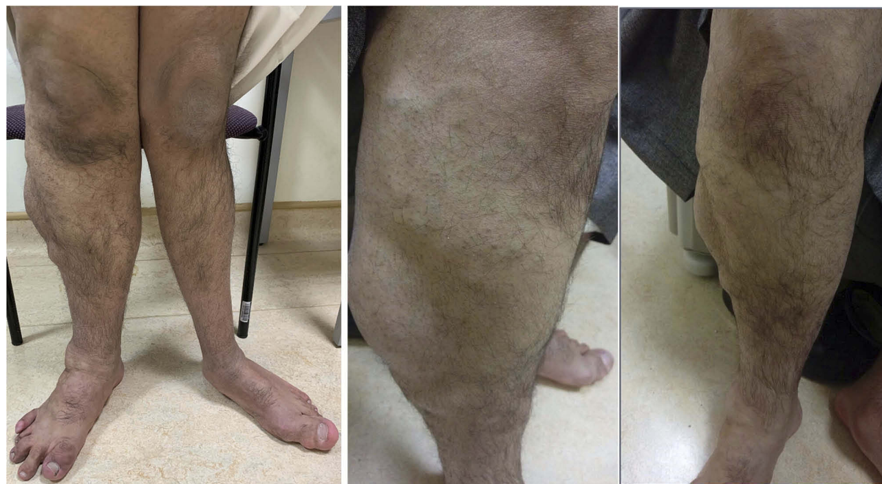
Figure 1 Composite figure depicting hemihypertrophy of the right lower limb and mega varicose veins.

The most likely diagnosis is Klippel-Trenaunay syndrome based on the presence of extensive lower limb varicosities, soft tissue hypertrophy with bone deformities, central nervous system arteriovenous malformation, and recurrent venous thromboembolism.