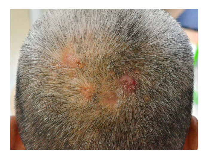
Figure 2 Pseudocyst of the scalp/alopecic and aseptic nodules of the scalp: soft and dome-shaped alopecic nodules, slightly erythematous and pustules on surface, surrounded by an area of normal skin.

The etiology remains questionable. Some authors assumed that it was a spectrum of follicular occlusions that cause deep folliculitis, leading to non-scarring alopecia and eventually a pseudocyst formation. Some believed that the follicular occlusion was only a predisposing factor as it was not observed in every case. In our opinion, the PCS/AASN