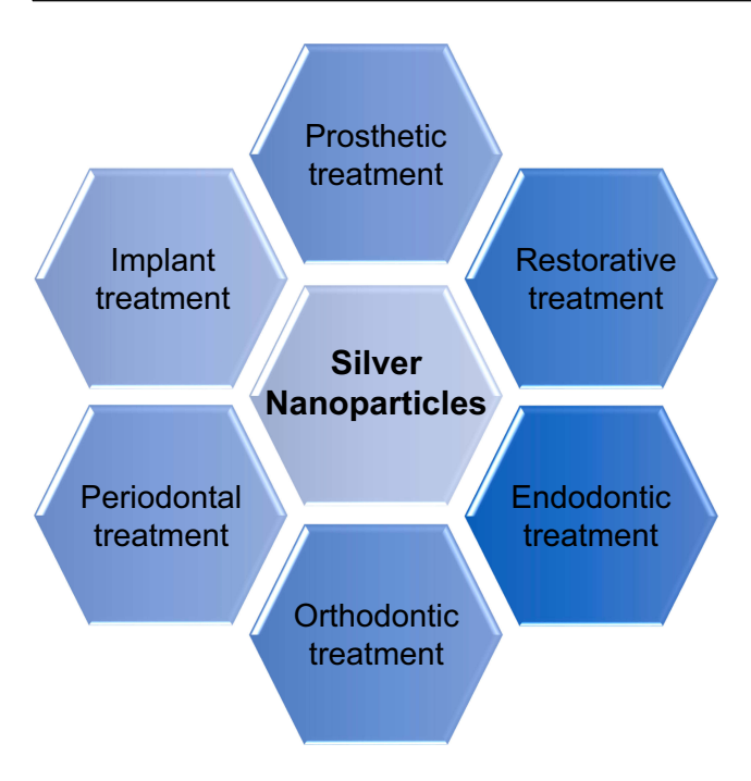
Figure 2 The antibacterial application of silver nanoparticles in dentistry.

silver nanoparticles has also displayed antifungal properties against the adhesion of Candida albicans , which is one of the key opportunistic pathogens on a denture base.<sup>22</sup>