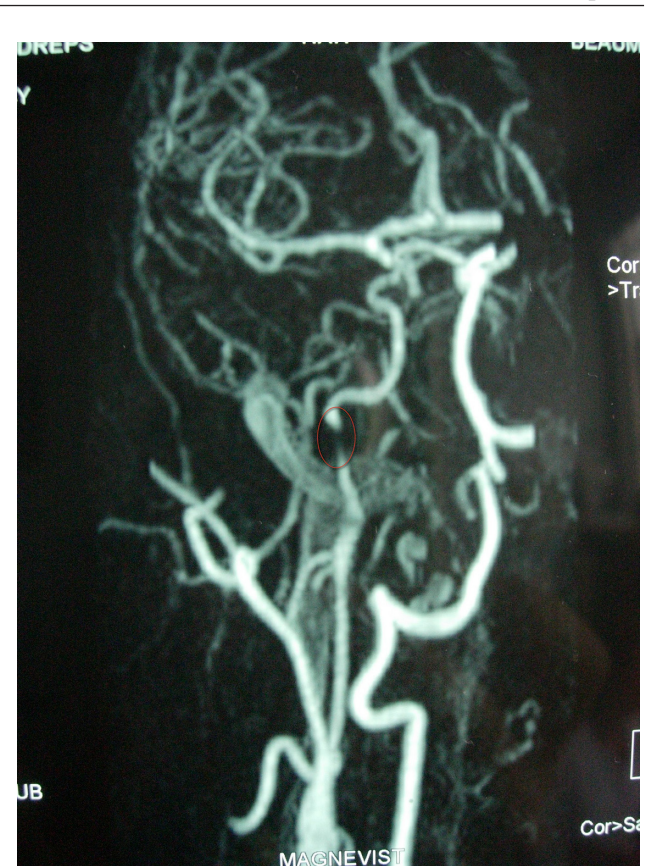
Figure 2 A magnetic resonance angiography (MRA) of patient I, which reveals global ischemia of the right cerebral hemisphere as well as dissection of the right internal carotid artery (circled).

Infiltration of the lateral nasal wall of the middle meatus, with 2 mL of the same solution mentioned above, was performed under endoscopic guidance. An incision was made in the lateral wall of the medial meatus 1 cm anterior to the posterior attachment of the middle turbinate. A mucosal flap was raised and the ethmoidal crest and SPA identified as it exits the sphenopalatine foramen. The artery was ligated using metal clips. The mucosal flap was replaced and no nasal packs were inserted after surgery.