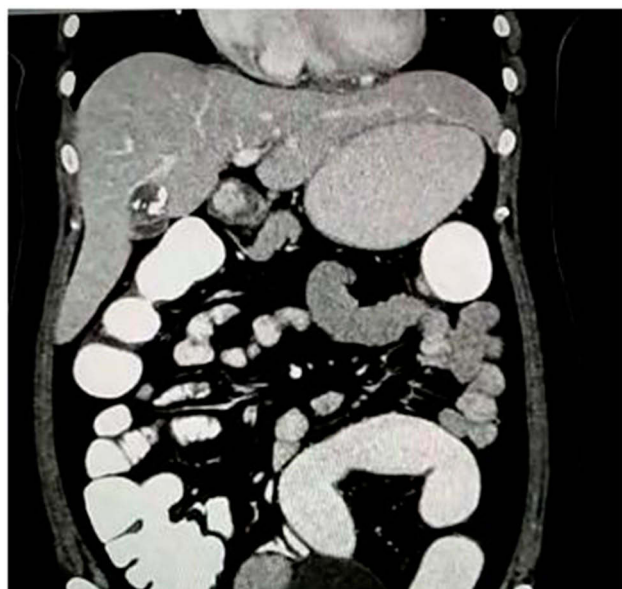
Figure 2 Computed tomography (CT) scan showing well-defined cystic lesion with internal septations and septal and peripheral calcification in segments IVa/IVb of the liver.