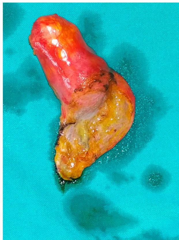
Figure 3 Inflamed deformed gallbladder after resection.

Secondary GBHC (Table 3): Ultrasonography of the abdomen was performed in 8/10 (80%) patients, computed tomography of the abdomen in 4/10 cases (40%). MRCP/MRI was performed in 4/10 cases (40%). Pre-operative diagnosis of hydatid cyst was possible in 7/10 cases (70%). Out of eight cases of USG, 5 (62.5%) had a pre-operative diagnosis, out of four cases of CT-scan able to diagnose pre-operative hydatid cyst in all four cases