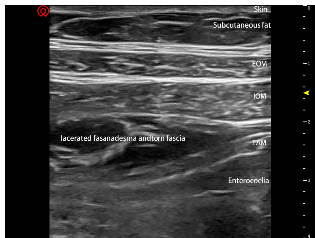
Figure 1 Fusiform shadow under ultrasound: three layers of muscles—external oblique muscle (EOM); internal oblique muscle (IOM); transverse abdominis muscle (TAM). The red symbol is the maker of the ultrasonic probe, indicating the position and direction of the ultrasonic probe. The yellow arrow indicates a depth of 1.5 cm from the skin.

dressings was applied. The same method performed for the TAPB was performed on the other side. The local anesthetic administered to the mother was prepared by an anesthesiologist who assigned a randomized group. The TAPB procedure was performed by another experienced anesthesiologist and assisted by an anesthesia resident physician. After TAPB, the patient was observed for 10 mins, and was confirmed to have no discomfort and returned to the ward. The information was returned by those who did not participate in randomization and TAPB. After explaining the VAS procedure to the patient, the nighttime VAS score was recorded by the patient in the score sheet.