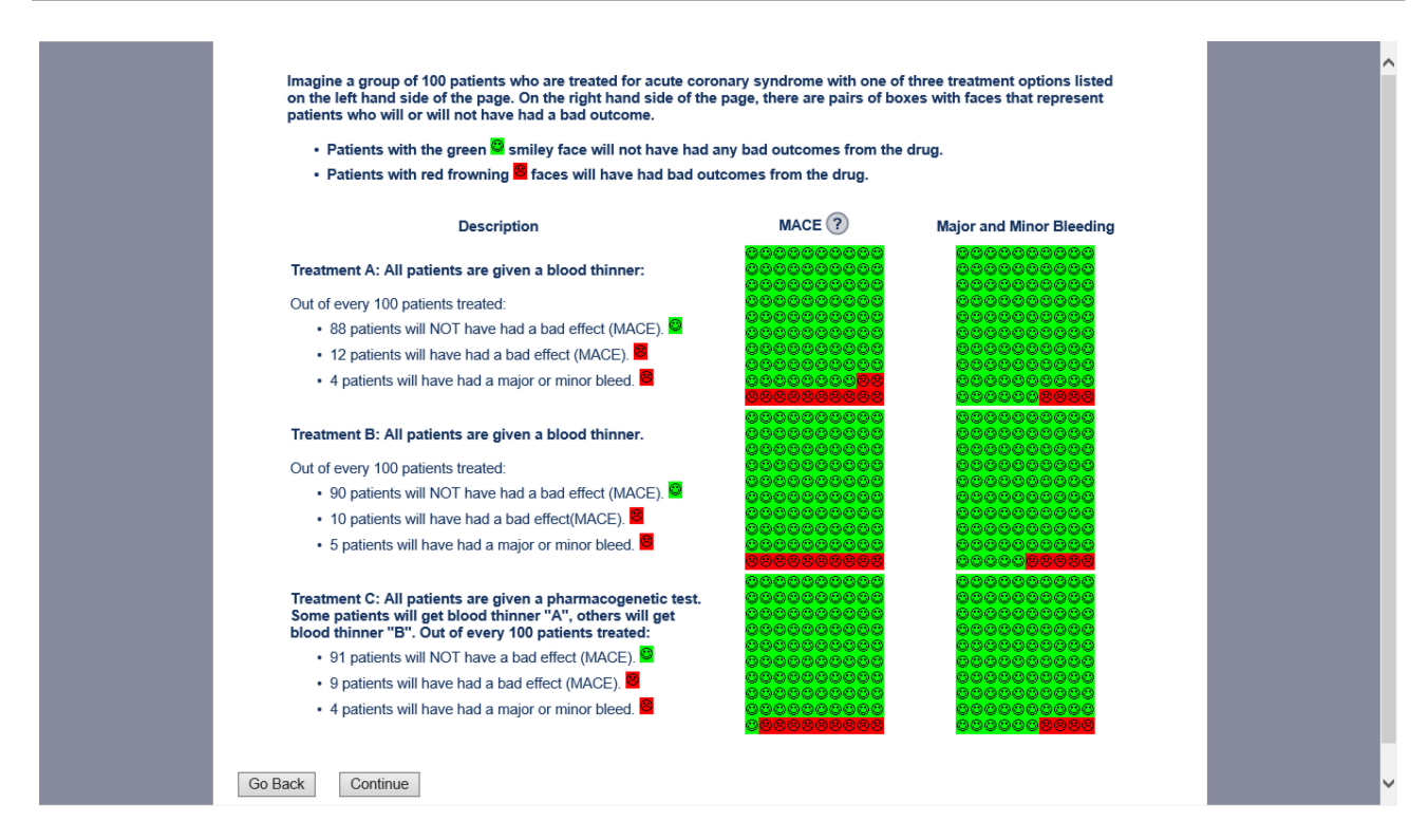
Figure 1 Screenshot: Decision board highlighting the available treatment options. Abbreviation: MACE, major adverse cardiovascular event.

of treatment with either prasugrel or ticagrelor. Treatment C represented the clinical outcomes of a PGx option where subjects who are non-carriers of loss of function (LOF) allelesare prescribed clopidogrel and LOF carriers are prescribed either prasugrel or ticagrelor.