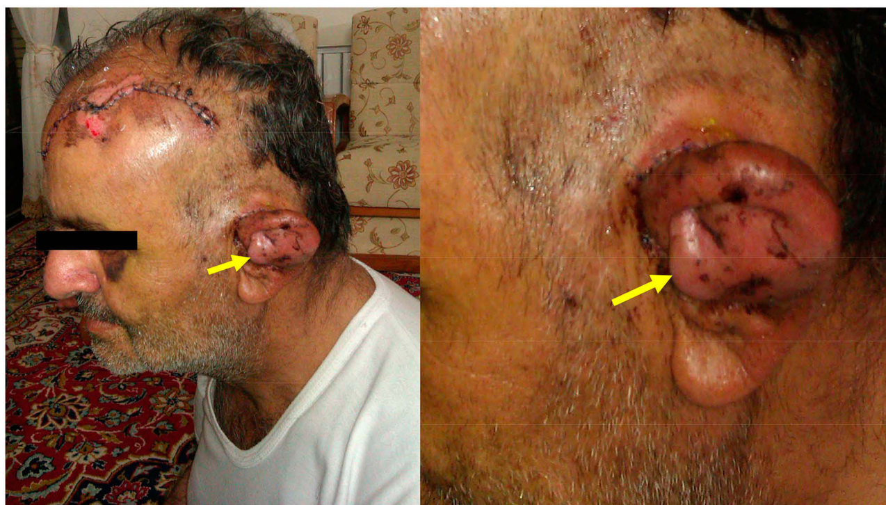
Figure 1 Auricular swelling of the left ear before surgical excision.

prevalence of mucormycosis differs regionally from 0.01–0.2/100,000 population in the US and Europe 6,7 to 14/100,000 population in India. 5 The most common clinical manifestations of the infection are rhino-orbito-cerebral (27–34%), pulmonary (21–30%), cutaneous (20–26%), and disseminated (14–15%). 8,9 Direct implantation of fungal conidia into the skin has been reported. Hurricanes, tornadoes, floods, and tsunamis play a major role in causing mucormycosis by inoculation of causative agents into the muscle, bones, and tendons. 10–14 Corticosteroid therapy can increase the risk of cutaneous mucormycosis; 15 however, the patient in the present case report had not taken any corticosteroid. Although trauma-related mucormycosis mainly occurs in adults, Kordy et al 16 reported a case of traumatic mucormycosis due to the Apophysomyces elegans in a child from Saudi Arabia. The infection was caused by a car accident and tearing the deep soft tissue in the soil. The patient was treated with surgical excision and administration of liposomal amphotericin B. The principal strategies regarding the treatment of this infection is a reversal of underlying immune-impaired or metabolic conditions, glycemic control, resection of necrotic tissue, and timely empirical antifungal therapy with liposomal amphotericin B, posaconazole, or voriconazole. 17,18 Even when fungal elements are seen in histopathologic examinations, cultures