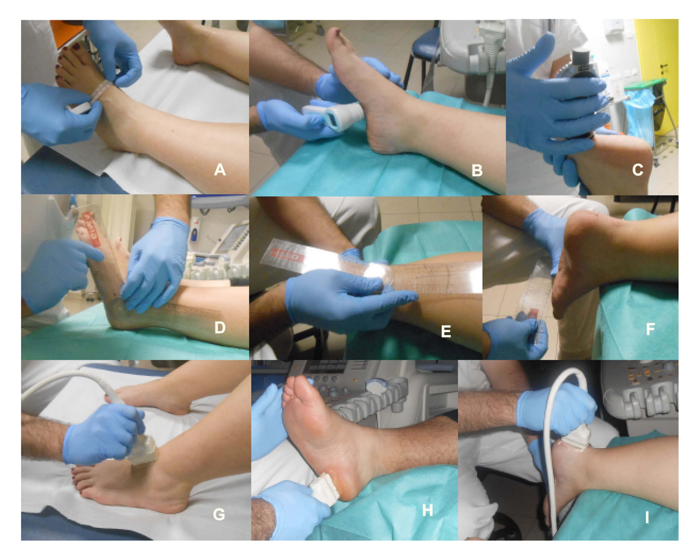
Figure I Practical assessment of anthropometric parameters (A), skin temperature (B), skin hardness (C), osteoarticular parameters (D-F) and ultrasound analysis at dorsum of the foot (G), at plantar surface (H) and Achilles tendon (I).

blood pressure and heart rate, both supine and upright were recorded. Arterial blood pressure was measured first supine, after 10 mins of rest with eyes closed in a dark and silent environment, by an aneroid sphygmomanometer. After the first measurement, the patient was positioned upright and the pressure measurement was repeated, within 2 mins of standing. The results were the mean of three consecutive measurements at a distance of 2 mins from each other, obtained by adding the values together and dividing by three.