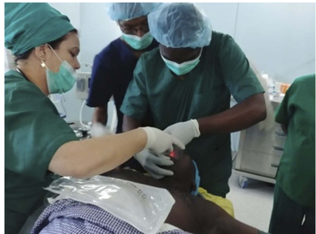
Figure 3 Endotracheal intubation training session in the operating theatre.

For the second stage of our program, we focused on the stage after successful intubation. For a successful RSI, the drugs used should be available, and the doctors must be aware of the correct usage. 9 However, HCQ had limited drugs for induction and paralysis. For example, agents like etomidate and succinylcholine, which are considered safe and widely used in RSI, were not available. We had to find alternative drugs, and selected ketamine and rocuronium instead. The RSI protocol itself was not a complicated process, but the team work between the doctors and nurses played a significant role in the success of the entire procedure. Nurses working in the ER and ICU were training in using the infusion pump, as the infusion speed of drugs had to be precisely controlled by an infusion pump via an intravenous line. The doctors also needed to know how to convert the conventional units (ug/kg/min) into the machine-dependent settings (cc/hr). These education sessions were done concomitantly. Continuous infusion of sedative agents for patients who were under mandatory ventilator modes was successfully set up and being administered by HCQ personnel, as a result of our ventilator lectures and practice. Moreover, the utilization of mechanical ventilators became more frequent, especially for severely ill patients in the ER and ICU.