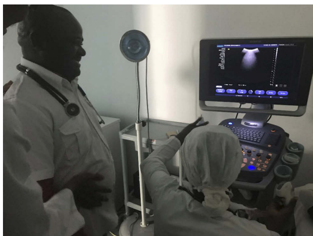
Figure 5 FAST examination.

increasing number of the concerns of the HCQ doctors, and they started to take the education program as a part of their day. The equipment and medical resources were reevaluated after every education session, and the report and feedback were then passed to the administrative director. This program was continuously done every week.