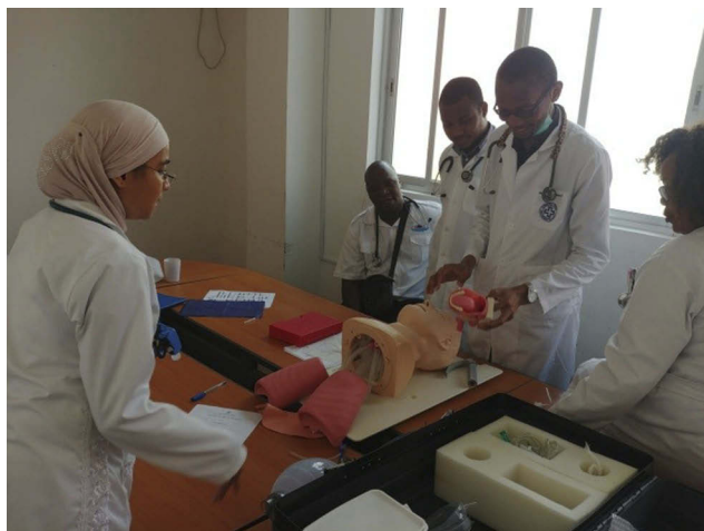
Figure 2 An intubation training model practice.

In actual patients, the doctors needed to consider rapid sequence intubation (RSI) and manage the mechanical ventilator. The majority of general physicians working in the ER and ICU had almost no experience in ventilator manipulation, although some of them had basic knowledge from textbooks or by indirect experience.