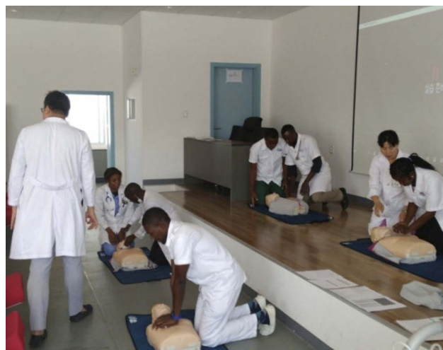
Figure 1 Group-based education in basic life support.

The importance of BLS and ACLS was acknowledged by the health workers in HCQ. However, owing to the lack of CPR experience with actual patients, the overall procedure of HCQ personnel was not satisfactory at the initial stage. Introducing BLS and making the participants capable of basic resuscitation were set as one of our goals. We performed several CPR practice sessions using mannequin models, such as Resusci Anne, in our lessons, as shown in Figure 1 . We grouped several teams composed of small numbers and simulated in-hospital cardiac arrest situations. The participants were enthusiastic about the program and showed improvement and proficiency after each session. It was not uncommon to find actual CPR cases in HCQ, and the HCQ health workers working in departments, such as