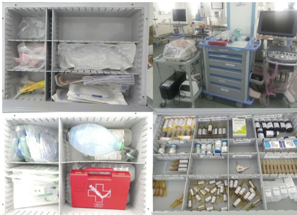
Figure 4 Emergency cart.

the emergency cart, placed in their necessary positions in the ER and ICU, as shown in Figure 4 .