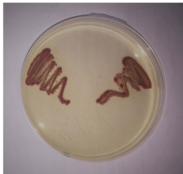
Figure 2 CHROMagar Acinetobacter for detection of MDR A. baumannii .