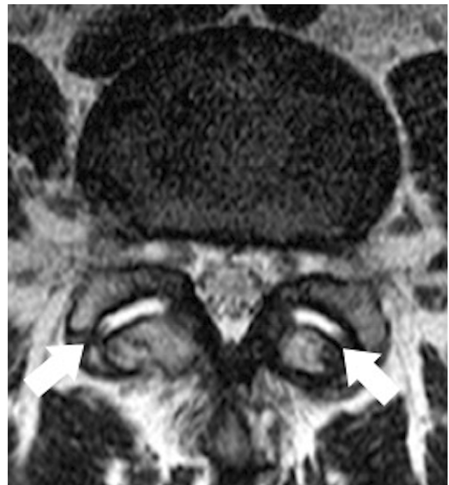
Figure 2 Representative magnetic resonance image showing facet effusion (arrows).

Multivariable logistic regression models were used to determine the relationship between FE and low back pain