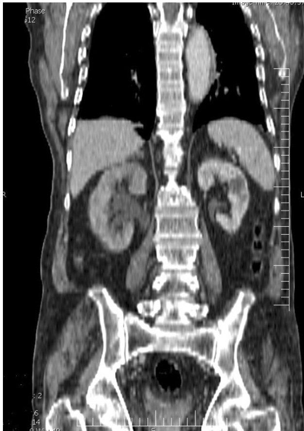
Figure 3 Hydronephrosis in the right kidney in the coronal cut of abdominopelvic CT scan.

set by the urologist. The samples were sent to pathology separately.