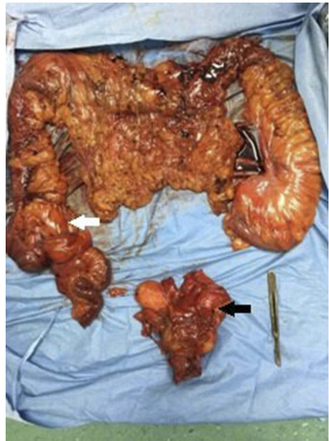
Figure 4 Surgical specimen following of total colectomy (the cecal mass was represented with white arrow) and total cystoprostatectomy (the specimen of prostate and bladder was highlighted with black arrow).

Grossly, the total colectomy specimen included colon sized 90×5.5 cm, a portion of ileum sized 20×1.8 cm, cecum sized 6×1 cm, and omentum sized 40×18 cm. On opening, a gray polypoid mass sized 4×3×3.5 cm was identified near the ileocecal valve, with distances from proximal and distal margins 23 and 63 cm, respectively. Apart from the whole specimen, there were 23 lymph nodes. The next one was a radical cystoprostatectomy specimen which included bladder sized 7.5×7×3.5 cm, covered by perivesical fat sized 10×5×4 cm, prostate gland sized 4.5×3.5×3 cm, right seminal vesicle sized 3.5×1 cm, left seminal vesicle sized 2.5×1.2 cm, right and left vas deferens sized 7.5×0.5 cm and 6.5×0.4 cm, respectively. The external surfaces of the specimen are unremarkable. On opening, a cream rubbery projected mass sized 1.8×0.7×0.5 cm is located on the anterior and lateral walls of the bladder. Cut section of the prostate gland revealed bilateral multifocal yellow discoloration up to 0.7 cm in diameter (Figure 4).