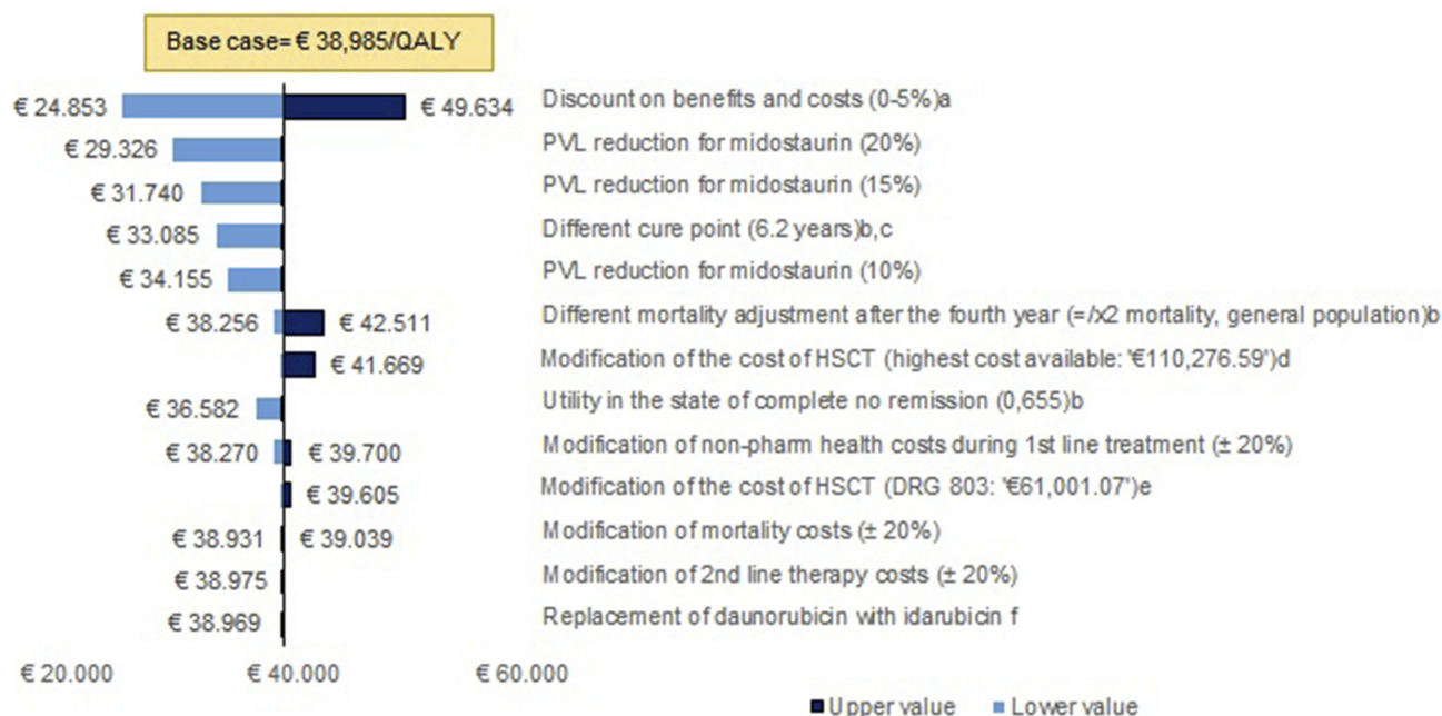
Figure 2 Univariate sensitivity analysis. a. Based on economic evaluation guidelines. b. Based on NICE recommendations. c. In keeping with the follow-up time in the RATIFY study. d. The highest cost of allogeneic HSCT found in the available evidence (eSalud). e. Cost of HSCT equivalent to the cost of DRG 803 ("Allogeneic bone marrow transplantation"). f. Based on expert opinion.

Abbreviations: AE, adverse events; PVL, ex-factory price.