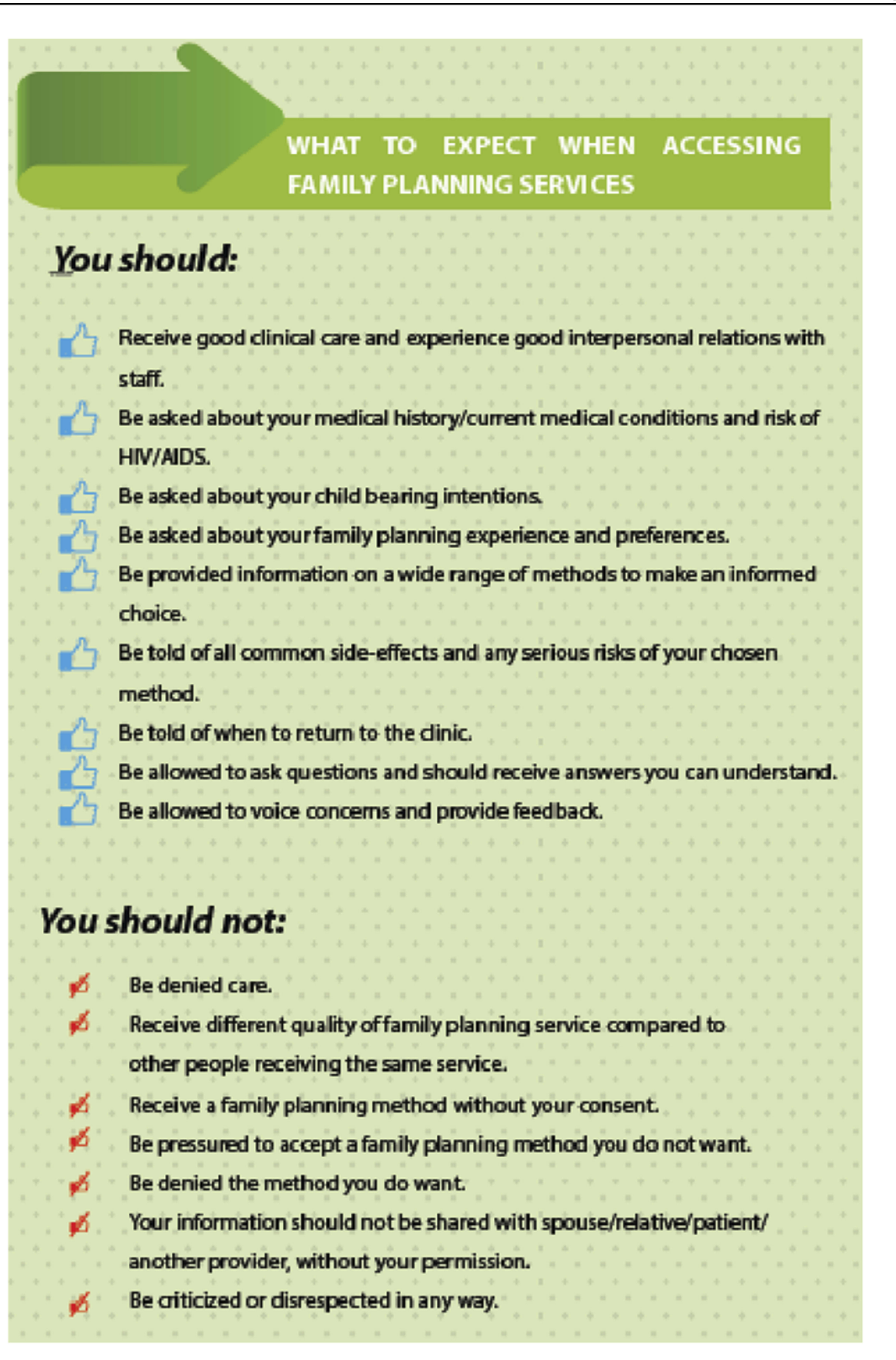
Figure 2 List of What clients should and should not expect from VRBFP Services, used in both Nigeria and Uganda.