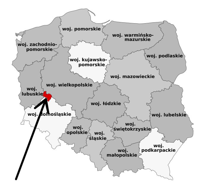
Figure I Wschowa county, Lubuskie province, Poland.

The inclusion criteria were meeting the IDF metabolic syndrome criteria, which means central obesity understood as waist circumference > 94cm plus meeting 2 out of 4 MS criteria, namely triglycerides \geq 150mg/dL or treatment for this lipid abnormality, glucose \geq 100mg/dL or previously