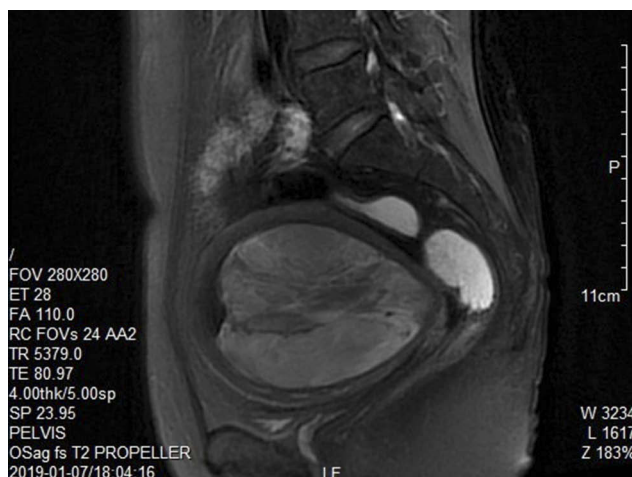
Figure 1 MRI showed a huge mixed-sign mass in the uterine cavity considering a uterine myoma with degeneration and bleeding.