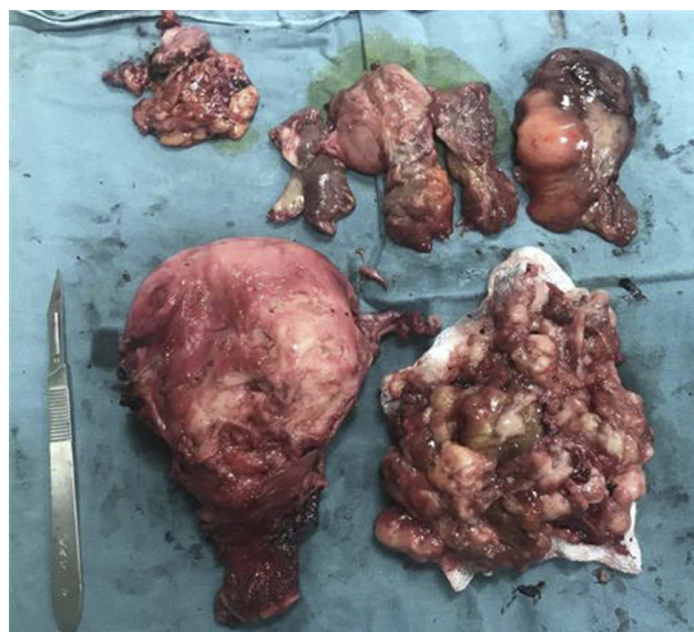
Figure 2 Uterine content was separated from the vagina by oval forceps in order to remove the whole uterus from the vagina completely.

that spindle cell tumors with rich cells and the forth showed uterine myoma with infarct. Nevertheless, postoperative pathological and immunohistochemical analyses of the surgical specimen revealed uterine leiomyosarcoma. Nucleus mitosis and coagulative necrosis were found under magnification 400× and one pelvic lymph node had metastasized (Figure 3).