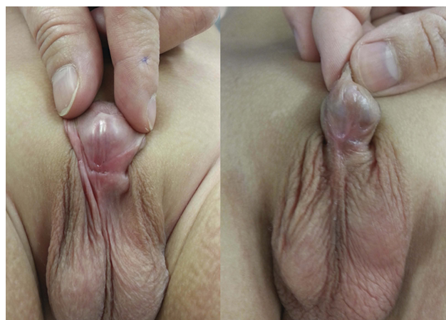
Figure 1 The hypospadias phenotype of a coronal/subcoronal meatus in the presence of distal penile penoscrotal angle fixation.

This study was approved by the Joint CUHK-PWH Clinical Research Ethics Committee, and the informed consent was waived given the retrospective nature of the study without reporting any personal identifiable information.