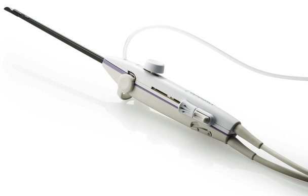
Figure 1 The Sonata treatment device, combining an intrauterine sonography probe with a radiofrequency ablation handpiece into a single integrated handpiece.

The two co-primary endpoints of the SONATA trial, as required by the FDA, consisted of menstrual bleeding reduction at 12 months and freedom from surgical reintervention due to heavy menstrual bleeding (HMB) through 12 months. Overall study success required meeting the individual success criteria for both co-primary endpoints. Each patient was considered to have had a successful treatment outcome if she experienced \geq 50\% reduction in PBAC score with the score being < 250 . In terms of study success for this endpoint, the lower confidence limit (LCL) of the percentage of patient success was \geq 45\% . For the