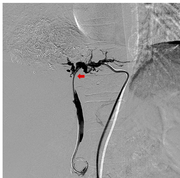
Figure 3 PTCD image shows extrahepatic bile duct stricture, while the intrahepatic bile ducts were dilated. The red solid arrow indicates the location of the lesion.

The overall rate of incidence of IVCTT in HCC is low, 1 and available evidence for the most appropriate therapeutic strategies for IVCTT is extremely limited. Palliative treatment with sorafenib or other systemic agents might be offered for these patients, the prognosis is dismal. Although an advanced HCC case with multiple metastasis and IVCTT showed complete response to Sorafenib was also reported. 17 For patients suitable for surgery, the survival time might be improved. Recently, Chen et al, 18 reported a relatively large series of 74 IVCTT cases treated with liver resection, a median overall survival (mOS) of 14 months was achieved