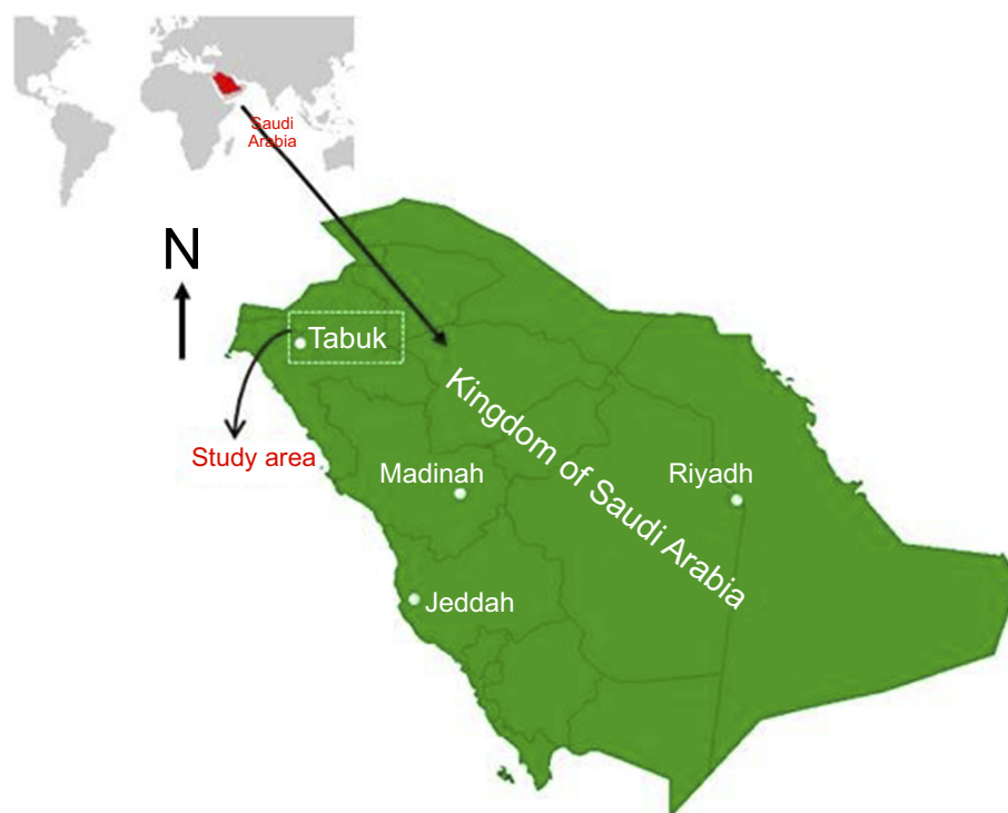
Figure 1 Study area location.

p: the probability of success (ie, AMR knowledge) =47.9%