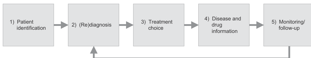
Figure 1 The five stages of the patient–physician partnership.

The physicians included in the study were members of a physician panel who accepted an invitation to participate. They were US-based neurologists and movement disorder specialists who had been in clinical practice for 3–60 years, saw at least 10 patients with PD in a month, and were