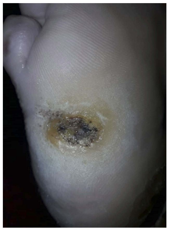
Figure 2 After intervention with honey.

After the intervention, the mean blood sugar level in the honey, olive oil, and control groups was 138.0, 147.9, and 153.1 mg/dL, respectively (p=0.69). The mean wound grade in these three groups after the intervention was