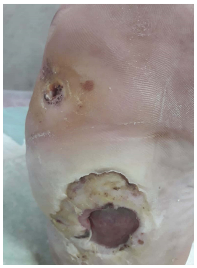
Figure 4 After intervention with olive oil.

Regarding the second study question, the results of the study showed that using olive oil in diabetic foot can improve the process of wound healing. Few studies have been conducted on the impact of olive oil on diabetic foot. In a clinical trial, Nassiri et al examined the impact of olive oil on the healing of diabetic foot. In their study, 34 patients were assigned to intervention and control groups. Olive oil was used in dressing of the intervention group. The results showed that using olive oil can help in the treatment of diabetic foot. In