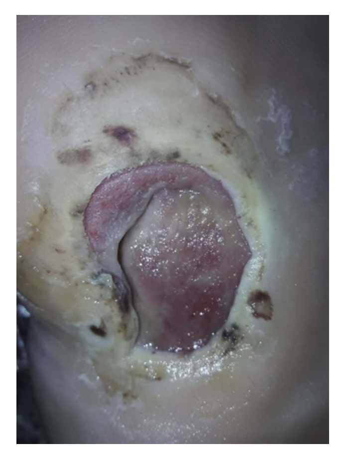
Figure | Before intervention with honey.