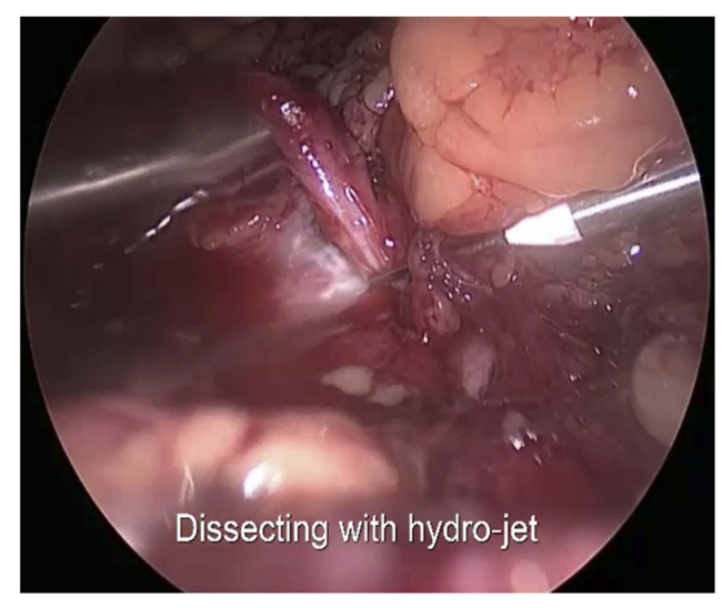
Figure 7 Hydrodissection of the ureter: less damaging (right side).

At this side, we decided to perform an omental wrapping around the whole hydrodissected ureter: A portion of the omentum that could be easily pulled and wrapped circumferentially around the ureter was used to isolate it from the retroperitoneum, and finally we transfixed the wrapped omentum with Vicryl 4–0 sutures.