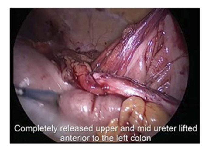
Figure 6 Completely released upper and mid ureter lifted anteriorly to the left colon.

Moving to the right side, the same procedure was done after tilting the surgical table to the left: a dissection of Toldt's fascia was undergone as well and the right ureter was identified on the right lateral border of the inferior vena cava and medial to the lower pole of the right kidney. Once the right upper and mid ureter was isolated, it was also totally dissected using hydrojet with the same parameters (Figure 7).