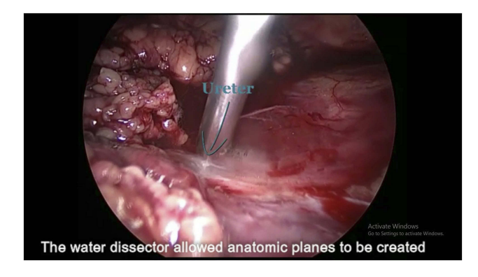
Figure 3 Identification and liberation of the ureter from its fibrous plaque using hydrodissection.

After it was identified, the ureter was liberated from its fibrous plaque using hydrodissection (Figure 3), then it was mobilized in an area above the level of the plaque. Then, we dissected the ureter off the plaque all over its target using the rigid angled tip Hydro-Jet probe of ERBEJET 2 device with a continuous water stream pressure of 41 bar to allow the preservation of ureteral sheath and vessels with no use of electrosurgery (Figure 4).