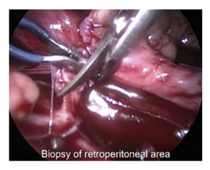
Figure 5 Biopsy from the fibrous tissue in the retroperitoneum.

After that, we took a biopsy from the fibrous tissue in the retroperitoneal area by a traditional method using laparoscopic scissors (Figure 5).