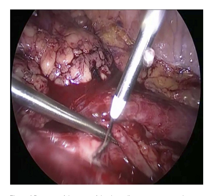
Figure 4 Dissection of the ureter of the plaque all over its target using the water jet (left side).

Continuous suction of the flushed normal saline by a traditional suction device tip was necessary during all the hydrodissection time.