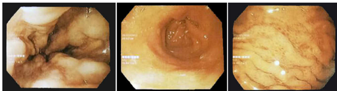
Figure 5 Esophagogastroduodenoscopy 2 months after surgery, esophageal varices grade 2 with the negative red color sign (left), cardia stomach edema (middle), and gastric snakeskin (right).

resistance to blood flow. 1,2 Patients with NCPH have proper liver function and normal liver parenchyma. 1-4 Classification and causes of NCPH are shown in Table 1. 5 PVT can occur 6–11% in cirrhotic patients, 9 but it is a rare finding in non cirrhotic patient. 3,4,9