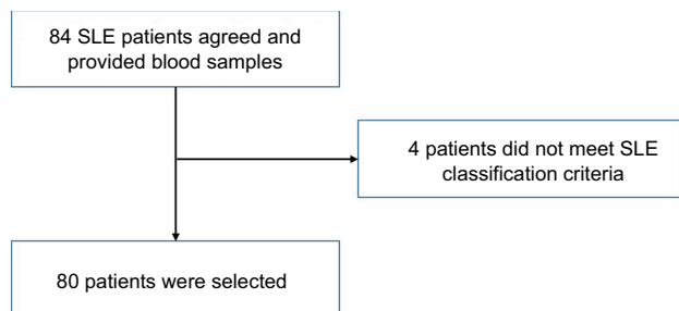
Figure 1 Selection of patients.

All patients met SLE classification criteria (American College of Rheumatology, ACR 1997), RA classification criteria (ACR/European League Against Rheumatism, EULAR 2010), scleroderma classification criteria (ACR/EULAR 2013), or Behcet's disease diagnostic criteria (Japanese Ministry of Health, Labor and Welfare). All participating subjects gave their written informed consent, and this study was conducted in accordance with the Declaration of Helsinki. The