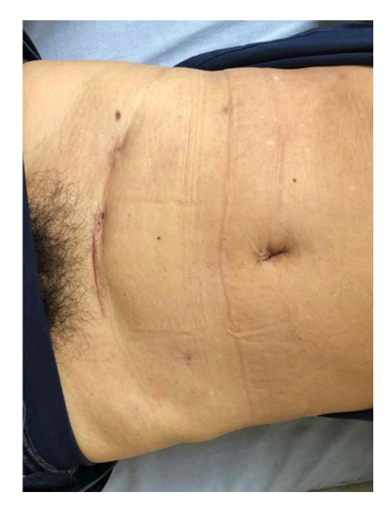
Figure 2 Pfannenstiel incision made 2–3 cm above the symphysis pubis at the border of the pubic hair.