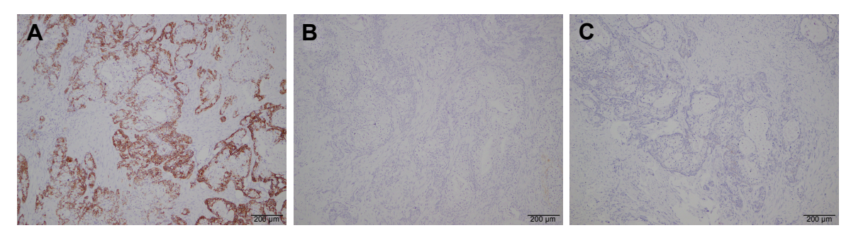
Figure 3 Immunohistochemically, tumor cells showed positivity for CK-7 ( A ) and negative for HNF-1 \beta ( B ) and CA9 ( C ). Abbreviations: CA9, carbonic anhydrase 9; CK-7, cytokeratin-7; HNF-1 \beta , hepatocyte nuclear factor-1 \beta .