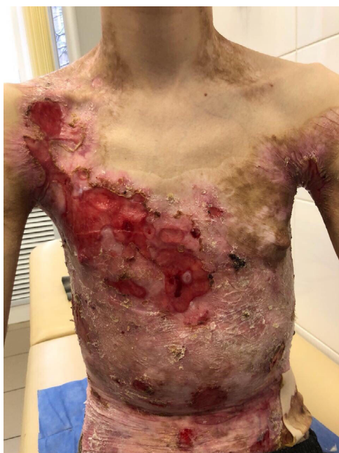
Figure 3 Appearance of lesions on the patient's chest and abdomen on presentation.

In the ankle and dorsum of the feet, there were minor red-colored erosions of irregular shape, with clear boundaries and multiple brownish-yellow laminated crusts on the surface. Areas of skin atrophy and scarring were noted on the periphery of the lesions.