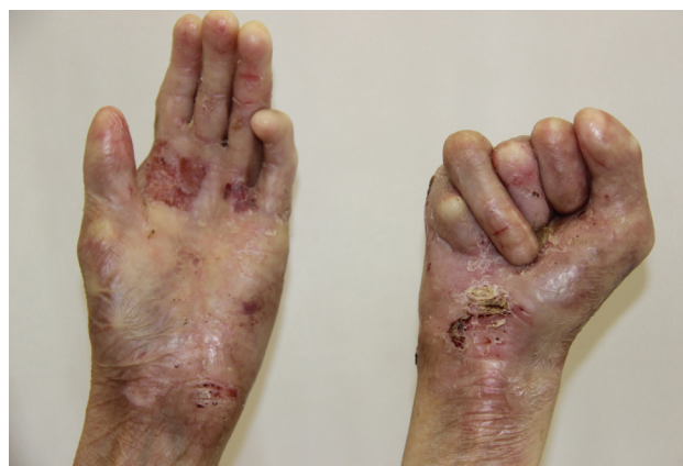
Figure 4 Appearance of deformities on the patient's hands on presentation.