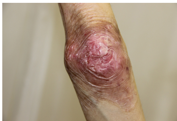
Figure 5 Appearance of lesions on the patient's elbow on presentation.