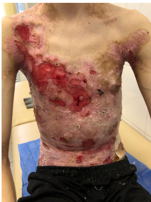
Figure 2 Appearance of lesions on the patient's chest and abdomen on presentation.