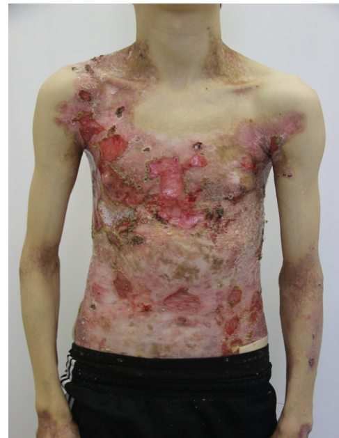
Figure 9 Appearance of lesions on the patients chest and abdomen on day 1 after discharge.

EB is a chronic, recurrent, disfiguring, and painful inherited connective tissue disease. The severe type can be challenging and difficult to manage; hence, it can dramatically affect the patient's quality of life. Patients with EB need