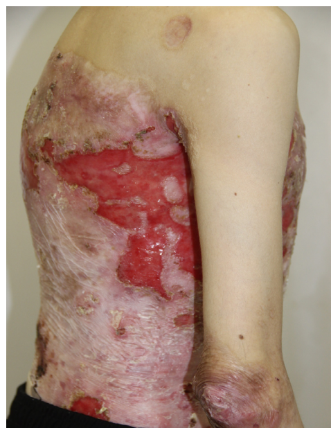
Figure 6 Appearance of lesions on the patient's lateral abdomen on presentation.

In addition, there were contractures and pseudosyndactyly in the first and second digits of the left foot, the first, second,