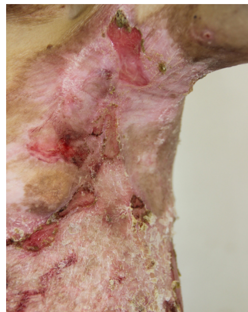
Figure 10 Appearance of lesions on the patients axilla on day 1 after discharge.

special ongoing care, frequent dressings, and a multidisciplinary approach, including a dermatologist, pediatrician and/or neonatologist or internist, anesthetist, pathologist, medical geneticist, pain specialist, specialized nurses, and psychiatrist or psychologist. In addition, an ophthalmologist, gastroenterologist, dentist, otolaryngologist, and endo-