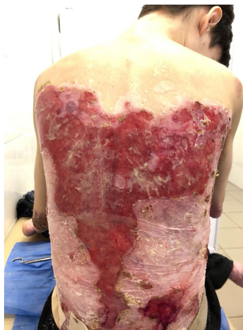
Figure 1 Appearance of lesions on the patient's back on presentation.

There were multiple erosions, which were bright red and irregular in shape, on the skin of the upper extremities, mainly in the shoulders, armpits, projection of the clavicle, and elbow and wrist joints. The surface of the erosions was marked by multiple-layered dirty yellow crust that secreted purulent discharge when pressed. The skin of the trunk, back, shoulder girdle, buttocks, inguinal areas, thighs, and knee joints showed extensive lesions of bright erythema, with erosive defect areas of atrophy of the skin, and multiple yellow crusts. He had pronounced flexion contractures of his hand joints with minimal finger range of motion. Although there existed finger deformities on the left hand, range of motion was preserved (Figures 1–6).