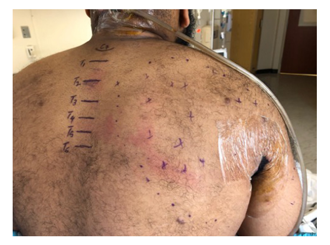
Figure 2 Extent of diminished sensation to pin prick on postoperative day 1; right shoulder and right scapula.