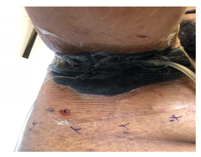
Figure 3 Extent of diminished sensation to pinprick on postoperative day I; right axilla and right anterolateral chest wall.

He requested the regional team perform the same block, as he was satisfied with the analgesia. ESB was performed in a similar fashion as described above with similar analgesic efficacy. Average time to first narcotic consumption after each T2 ESB was 39.3 hours.