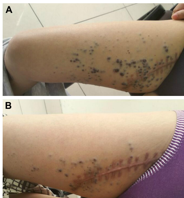
Figure 1 (A) The primary lesions before (B) and after the four courses of medication.

Abbreviations: No, number; ECOG, Eastern Cooperative Oncology Group; TMZ, temozolomide; DTIC, dacarbazine; DDP, cisplatin.