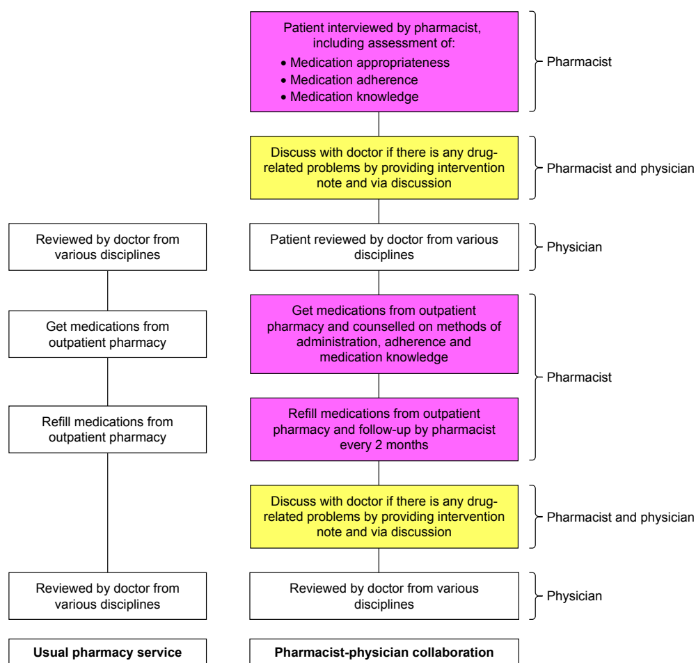
Figure 1 Collaboration framework between pharmacists and physicians.

consists of eight items, and the scorings are categorized as: non-adherence (scores <6) and adherence (scores 6–8). 28 Knowledge of the participants concerning the use of their medications was assessed based on their understanding of the correct doses, frequencies, indications and time of administration of their medications. Participants' knowledge about their medications was measured as percentage of medications that they were able to respond correctly in terms of dose, frequency, indication and time of administration. Each of these domains was analyzed separately.