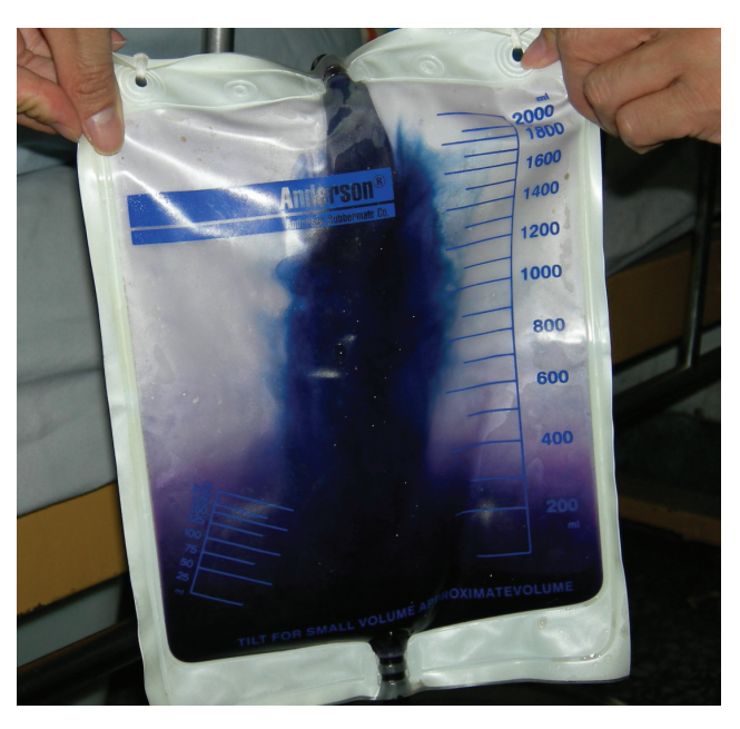
Figure 3 The longer the PVC bag stayed in use for a patient, the deeper the color purple the bag became, despite changing sterile PVC urine bags from 2 different companies.

femoral neck about 3 years ago. He suffered from PUBS off and on for 10 months. He regularly took doxazosin mesylate (Doxaben®) 1 mg per day for hypertension and BPH, and quetiapine fumarate (Seroquel®) 100 mg per day for vascular dementia with delirium.