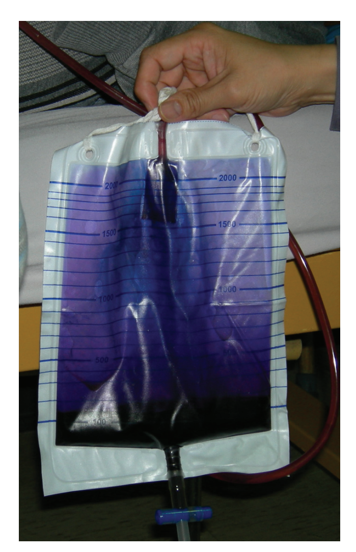
Figure 2 The urinary catheter drainage system with changing color from red to purple and sometimes with differently colored tube and bag in case 3 with purple urine bag syndrome.

Case 5, an 80-year-old male, had been a patient with vascular dementia (VaD) with delirium since 2 years ago. He had also suffered from hypertension and BPH for 20 years. He became long-term bedridden because of fracture of the left