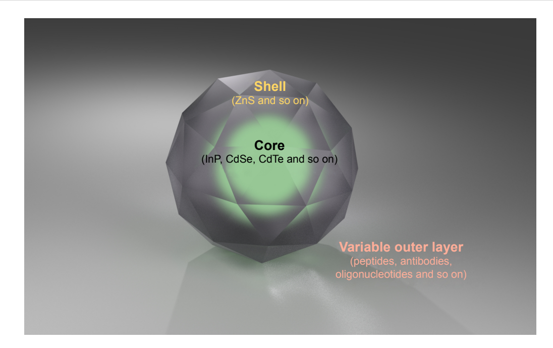
Figure I The basic structure of QD is composed of a core and a shell.

Note: It can also be designed for the purpose of enhancing biocompatibility with addition of variable outer layers, such as peptides, antibodies, oligonucleotides and so on. Abbreviation: QD, quantum dot.