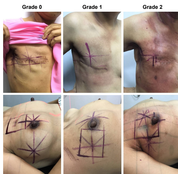
Figure 2 The representative images of grade 0, grade 1, and grade 2 dermatitis in postmastectomy radiotherapy (top panel) and postlumpectomy radiotherapy (bottom panel).

Abbreviations: 2D, two-dimensional; IMN, internal mammary nodes; IMRT, intensity-modulated radiotherapy; SCN, supraclavicular nodes.