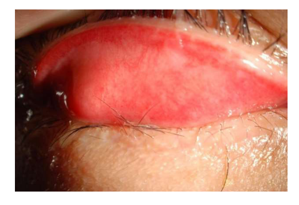
Figure 3 Conjunctival finding of case of AdV type 54. Moderate follicular conjunctivitis with eye discharge of a 32-year-old man is shown. Abbreviation: AdV, adenovirus.

The complete genomic sequence of HAdV-54 (Kobe-H strain) was deposited in GenBank (accession no AB333801) as the prototype strain.<sup>8</sup> As mentioned earlier, HAdV-54 has caused epidemics continuously only in Japan in the past decade.<sup>11</sup> However, there have been few studies describing its clinical features. It has been reported that a high incidence of MSI (53%) was observed in an epidemic of EKC due to HAdV-54 occurring in a nursery school in Kobe City, Japan in 2008.<sup>11</sup> However, the detailed features of the clinical findings of EKC due to HAdV-54 have not been previously reported. There was a difference in the study population between the present study and that of Akiyoshi et al.<sup>11</sup> We reported a regional community-scale epidemic in a broad age group; in contrast, Akiyoshi et al reported a nosocomial infection