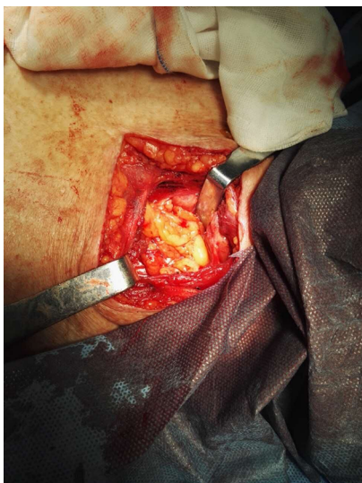
Figure 3 Cervical area anastomosis.

The \chi^2 test and Fisher's exact test were used for the qualitative data. Comparisons between groups were done using the independent samples t -test for independent samples in case of normal data distribution and the Mann–Whitney U test in case of non-normal data distribution. Multivariable model used for prediction of anastomotic leakage was logistic regression. Odds ratios summarized the association between predictors and the presence of anastomotic leakage. P < 0.05 was regarded as statistically significant. All statistical analyses were performed with SPSS statistical software package 13.0 (SPSS Inc., Chicago, IL, USA).