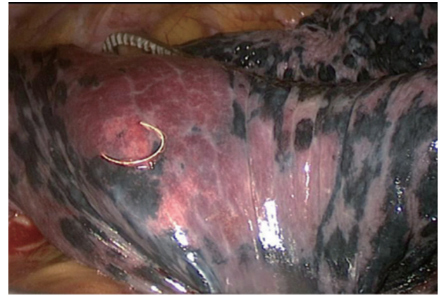
Figure 2 The deep lesion was located by the microcoil on the visceral pleura surface under thorascopic guidance.

Note: From Sui X, Zhao H, Yang F, Li JL, Wang J. Computed tomography guided microcoil localization for pulmonary small nodules and ground-glass opacity prior to thorascopic resection. J Thorac Dis. 2015;7:1580–1587. With permission from AME Publishing Company. 14