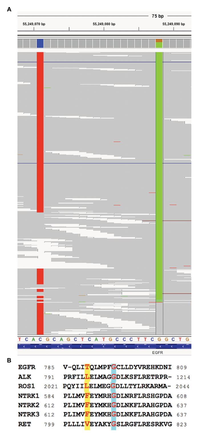
Figure 2 (A) Integrated genomics viewer highlighting the presence of a C>T at codon 790 (EGFR T790M) mutation (red) oriented in cis with a G>A at codon 796 (EGFR G796S) mutation (green). Overlapping reads spanning the T790M and G796S indicate cis orientation on the same allele. (B) The RTK sequence alignments across relevant TKIs with the gatekeeper residue highlighted in yellow and the relevant solvent-front residue in teal.

Abbreviations: EGFR, epidermal growth factor receptor; RTK, receptor tyrosine kinase; TKI, tyrosine kinase inhibitor.