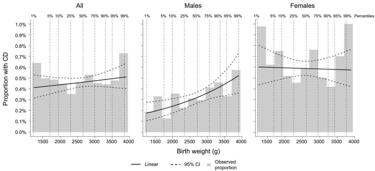
Figure 1 Observed proportion with CD by birth weight. Notes: Percentiles refer to the percentage of individuals with a birth weight lower than indicated. Linear refers to a modeled proportion in a logistic regression with an effect that is linear on the log-odds scale. 95% CI refers to 95% bootstrap CIs of modeled proportion with CD based on 10,000 repeats. Abbreviations: CD, celiac disease; CI, confidence interval.