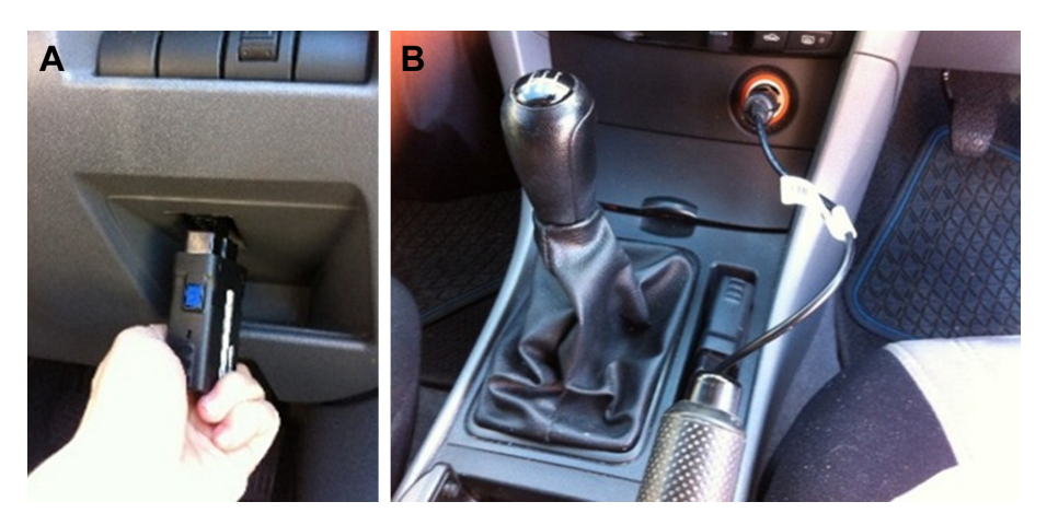
Figure 3 In-vehicle driver monitoring device inserted either into the On Board Diagnostic II (OBD II) port of the vehicle (A) or the cigarette lighter (B).

Participants were instructed to return the travel diary and the in-vehicle monitoring device at the end of the 7-day period in a pre-paid envelope. Participants were then interviewed to verify that there were no issues while using the device and that they were the only driver of the vehicle while using the device. The data from the devices was then read by Fleet management Software (MyGeotab, Oakville, Canada) and uploaded by the researchers to a secure server at the University. The data was cleaned in order to exclude trips made from the University, as they were not part of the participants' typical driving behavior. Trips that lasted fewer than 10 seconds or 200 meters were also excluded in order to avoid "false trips". The devices collected a variety of time stamped second-by-second GPS data, such as date of travel, location, type of roads used, start/stop times of trips, and distance traveled. Night time was defined as the period between sunset and sunrise. Peak hour was defined as driving between 6 and 9 am or between 4 and 7 pm, Monday to Friday. Each of the routes driven by participants were represented on an interactive map provided by Geotab, which identified whether participants drove on highways/freeways and/or heavy traffic roads. Heavy traffic roads were defined as roads where there were >4,000 vehicles per day per lane<sup>38</sup> (Figure 4).