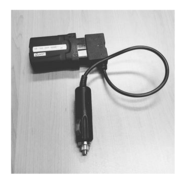
Figure 2 In-vehicle driver monitoring device.

self-regulating or non-self-regulating their driving in each of the driving situations. These situations included "driving on highways/freeways", "on heavy traffic roads", "in peak hour traffic" and "at night time".