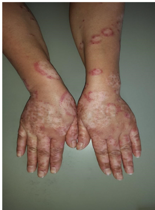
Figure 1 Psoriatic lesions superimposed on vitiligo patches and forming advancing border of vitiligo lesion.

The frequency of psoriasis among healthy control was 2 (0.4%) versus 15 (6%) among vitiligo patients. There was a statistically significant difference ( P value < 0.001 ; Table 2).