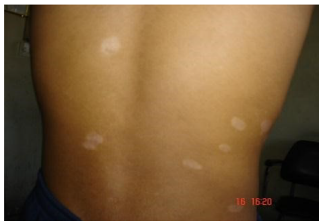
Figure 3 Leukoderma or vitiligo following healing of psoriasis.

patients with psoriasis had a lower chance to develop vitiligo as frequency of psoriasis among vitiligo patients was 6% while the frequency of vitiligo among psoriasis was 2% only.